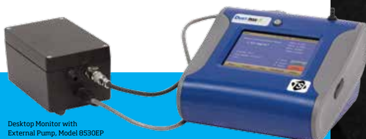
Desktop Monitor with External Pump, Model 8530EP