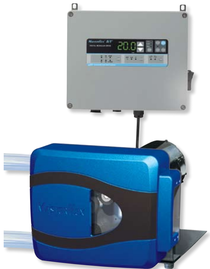
B/T® modular digital pump 940-2610 with IP56-rated controller includes a new and improved Rapid-Load® pump head.